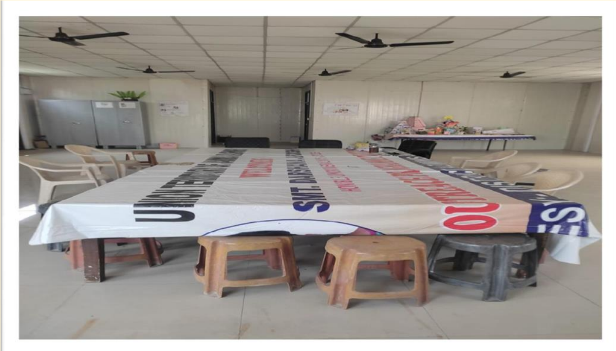
Home Science Lab