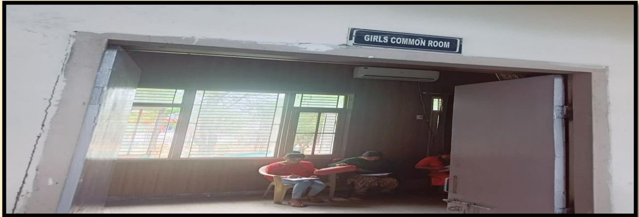
Girls Common Room