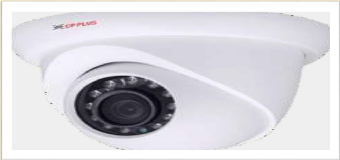
Security : 24 × 07 Security Guard, CCTV Surveillance