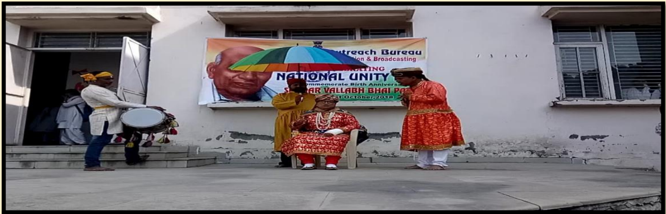
Open Air Theatre