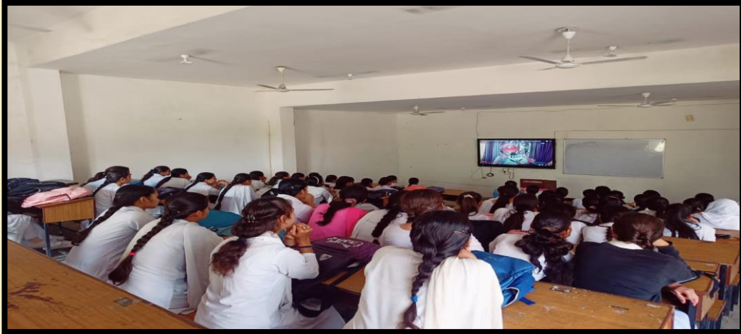
ICT enabled Class rooms