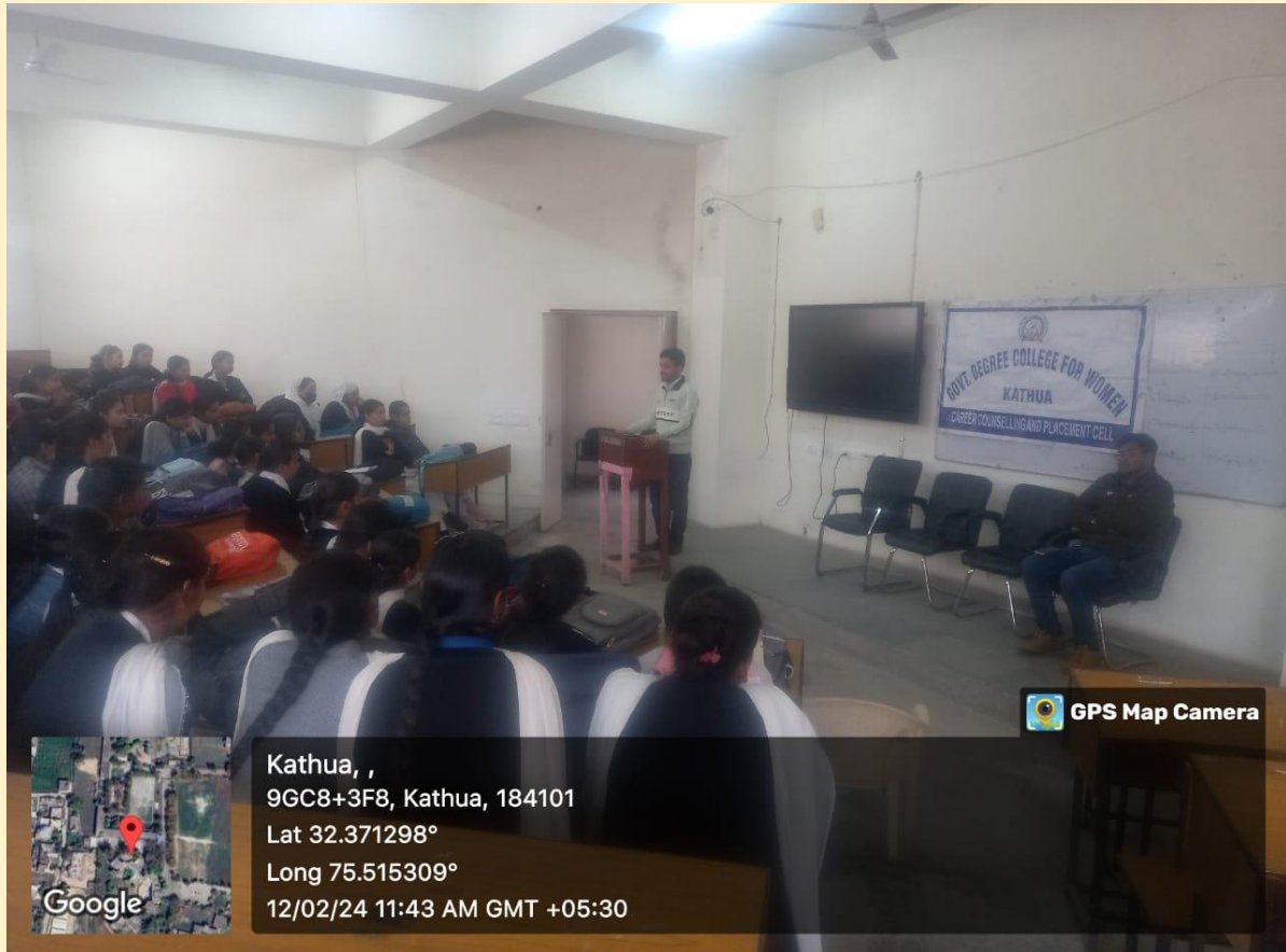
Workshop on basic office tools by Computer Science Deptt.