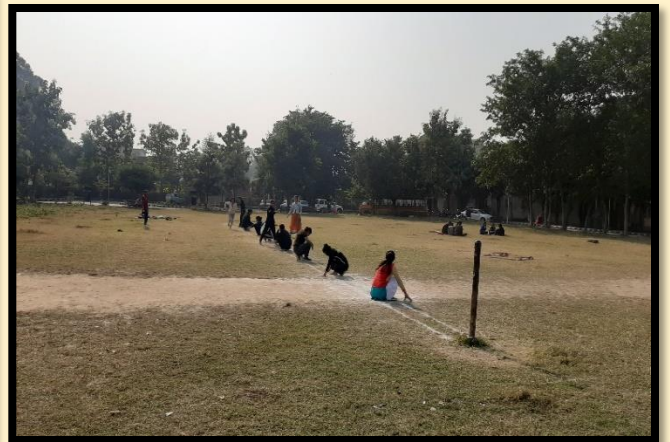
Kho Kho Field