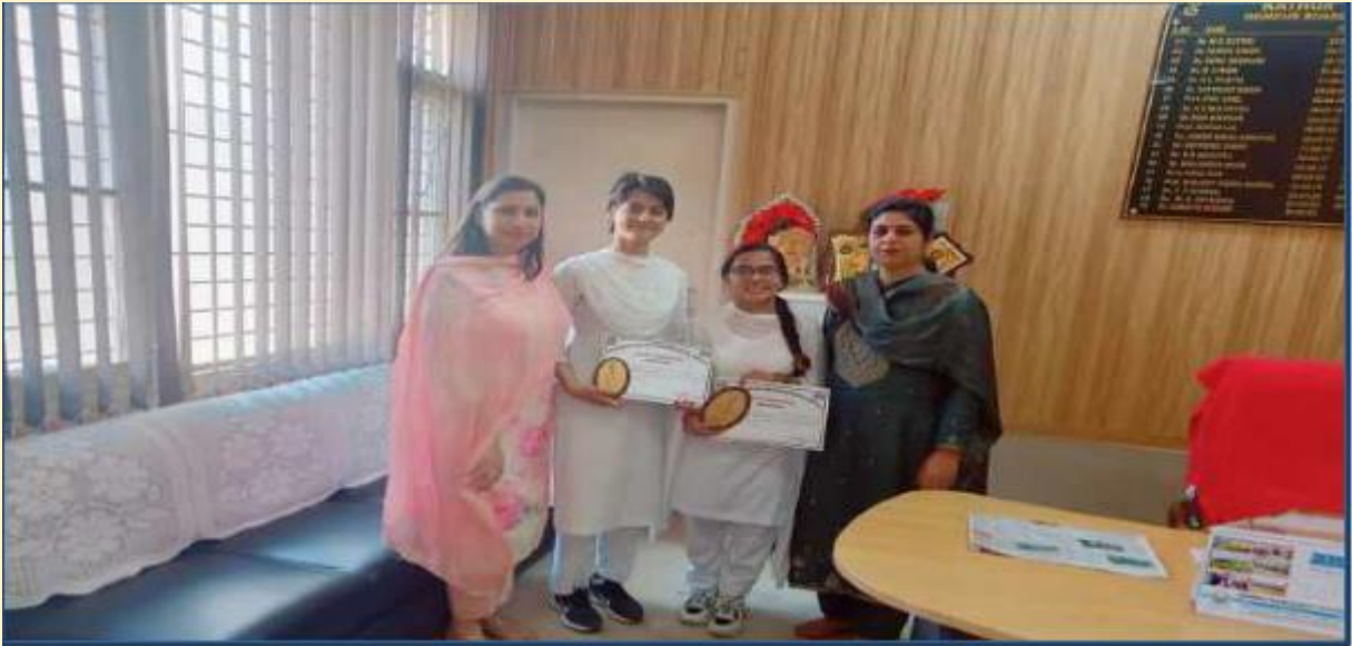
Organisation of start-up festival "Start-up Fest"