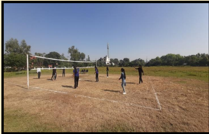
Volley Ball Ground