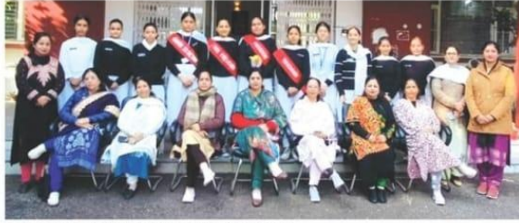
Participants during the Investiture Ceremony.